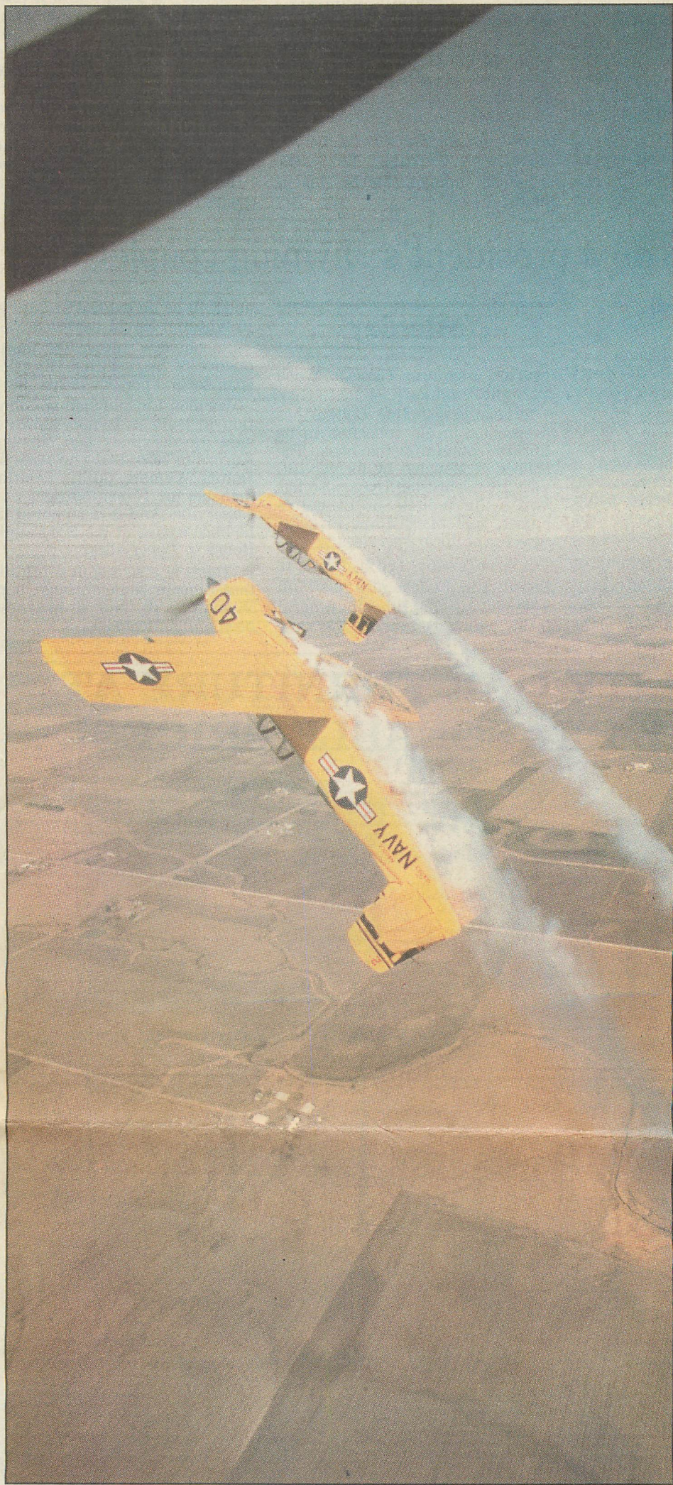
Lima Lima Flight Team pilots, who wear a winged insignia (above, right), fly their former Navy trainers out of the Naper Aero Club field in Naperville.