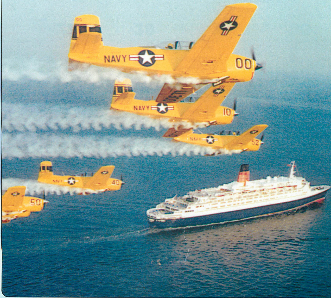
Lima Lima Flight Team saluting the Queen Elizabeth II as it leaves New York Harbor, Sept., 1999